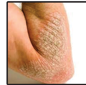
Dull & dry skin