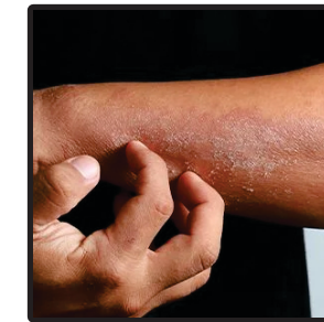
Itchy, hard & scaly skin